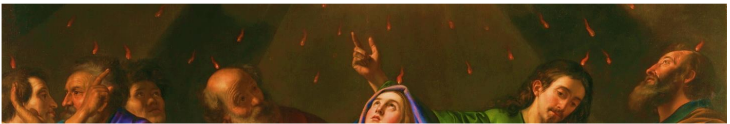
Details - top, from Christ's Baptism by Piero della Francesca c1440; and bottom, from Pentecost by Juan Bautista Maino, c1615

Gospel: John 15.26f; 16.12–15 Jesus promises his disciples that they will not be left to their own devices. The 'other' Advocate will come, dwell in them, 'guide them in all the truth' (v.13). It is quite impossible today, even for AI, to know 'all the truth'. Christians do not believe (like the world does believe) that humanity advances toward truth, by dialogue and cooperation. We believe it is the Holy Spirit—living in, and moving between, Christians—that enables them to understand what is happening; and, in the length of time, to apprehend the deepest truth of the Saviour's teaching.