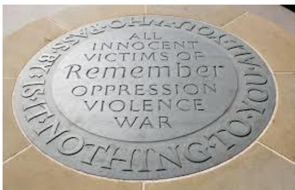
Rarely has the Innocent Victims memorial at Westminster Abbey seemed so very relevant as in the last few weeks

Peace in Ukraine Mother of God, Our Lady of Kiev, intercede for the people of Ukraine and their government, and all who suffer as a result of war. Be with them as you stood by your Son. Give them strength and courage through faith, hope and justice. May we in our turn support them through prayer and generosity: so that lives may be saved, injuries healed, the dead may rest in peace, and there will be just peace after war. Through Christ our Lord.