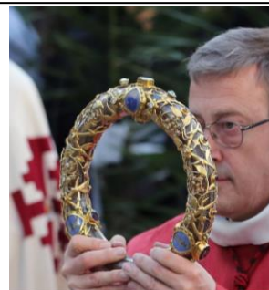
Relic of the Crown of Thorns, Paris

REFLECTIONS on today's scriptures Today, the last Sunday of the liturgical year, we are celebrating the Our Lord Jesus Christ, King of the Universe. We know from the Gospels that Jesus refused the title of king when it was meant politically, by the standards of the 'rulers of the Gentiles' (Mt 20.25). On the other hand, during his Passion, he claimed a unique kingship before Pilate, who explicitly asked him 'So you are a king?', and Jesus answered, 'You say that I am a king' (Jn 18.37). However, moments before, he's qualified it ... 'My kingship is not the worldly sort ' (Jn 18.36). The Father entrusted two missions to His Son: (1) to give mankind eternal life by loving us 'right through to the end'