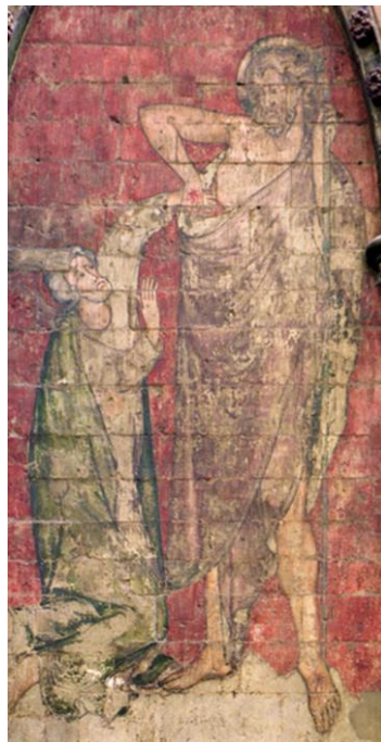
Westminster's 9ft Christ and St Thomas

First Reading: Acts 4.32-35 The small Christian communities which quickly emerged all across modern-day Turkey and the Aegean, drew the attention of their neighbours. The early Christian writer Tertullian claimed, sometimes with sarcasm and sometimes with admiration, that they were spoken of as 'those who love one another.' The impression we form may be idealised (which is perhaps an indicator of our own cynicism) but the image is at all times of a community which, as a consequence of celebra-