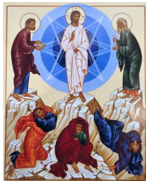
Icon of the 'Metamorphosis'

REFLECTIONS on today's scriptures We're only at the end of the first full week of Lent and it comes as no surprise that some of the promises made as we received Ashes on our heads are a bit shaky, our Lenten feet getting a bit weary. Jesus had set out on a journey to Jerusalem that he'd hinted might be his last. The apostles must have felt dispirited but perplexed too. Why was Jesus so bent on going up to Jerusalem – going into 'enemy territory'? The invitation to Peter, James and John to climb Mount Tabor was designed to lift their spirits, and to help them, during His passion, to understand why He was so resolute: namely, hope of resurrection and a radically new horizon of life. What the Transfiguration kindled in those three men, can give our hearts courage and hope also, and grace for our Lenten resolutions.