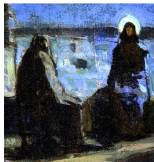
Jesus and Nicodemus

First Reading (OT): 2 Chronicles 36.14-16, 19-23 A key moment in Jewish history. Like the exodus through the Red Sea, the destruction of Jerusalem and its Temple, and exile to Babylon, define what it means to be Jewish. Because they were themselves responsible. They had adopted the lifestyle of pagan nations, and turned their backs on their God. Yet there was hope - if they learn, convert, rebuild the shattered relationship with God. Confronting failure, acknowledging sins, turning away from love of the world, rebuilding relationship with God ... that's Lent.